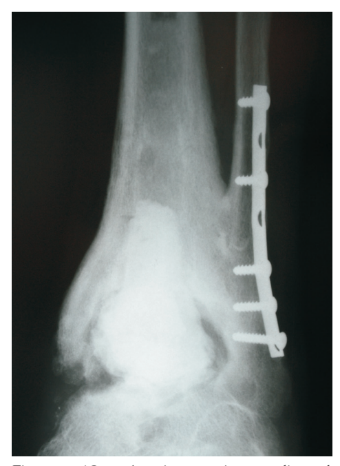
Figure 6C. Anterior-posterior radiograph demonstrating removal of tibial and talar components with antibiotic impregnated cement spacer after intraoperative frozen section and gram stain confirmed deep infection. Revision with conversion to arthrodesis performed 3 months after.