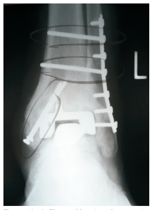
Figure 6A. A 71-year-old patient demonstrating failure 5 years post implant arthroplasty with lysis surrounding the tibial component and mild subsidence of the talar component.