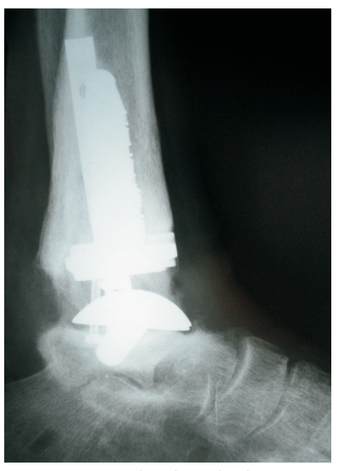
Figure 6B. Lateral radiograph demonstrating revision arthroplasty using a modular stem implant with radiographic evidence of lysis surrounding the talar component and mild subsidence suggesting infectious process.

Figure 6C. Anterior-posterior radiograph demonstrating removal of tibial and talar components with antibiotic impregnated cement spacer after intraoperative frozen section and gram stain confirmed deep infection. Revision with conversion to arthrodesis performed 3 months after.