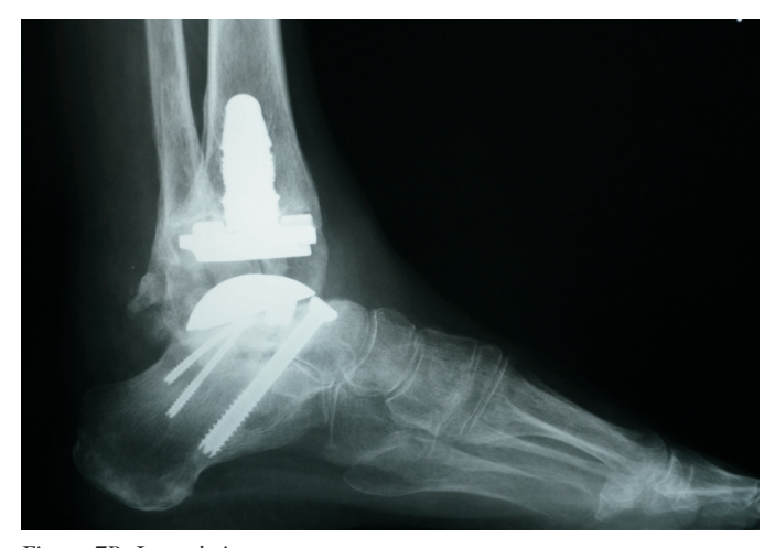
Figure 7B. Lateral view.

undergoing STAR prosthesis implantation. They found 12% required metal component revision, and 18% required poly exchange over a mean follow-up of 9 years. The revision rate was substantially higher in the first 20 cases, alluding to the learning curve, which has been previously reported by several other authors for TAR (17,62). Adams et al looked at early and midterm results of 194 primary Inbone I TARs to find a 6% revision rate at a mean of 1.6 years. Talar subsidence was a noted reason in 6 revision cases, and the authors recommend continued investigation into the reason for subsidence, which may include the introduction of surgical instrumentation into the subtalar joint with Inbone I and II, which may damage vascularity of the talus leading to this particular complication (19).