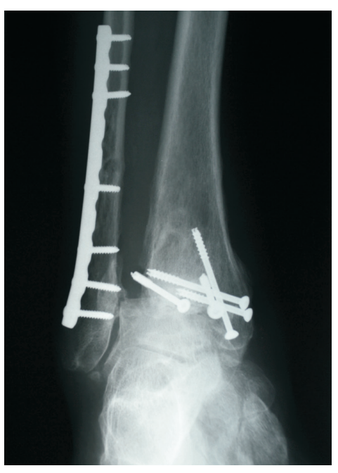
Figure 3. Anterior-posterior radiograph demonstrating significant syndesmotic instability status post open reduction internal fixation of a trimalleolar ankle fracture. Note the absence of syndesmosis fixation.

Rodrigues-Pinto et al completed a prospective multicenter study using a third-generation implant comparing clinical outcome data, range of motion, and complication and survivorship rates in patients younger than 50 years old to those older than age 50 (39). One-