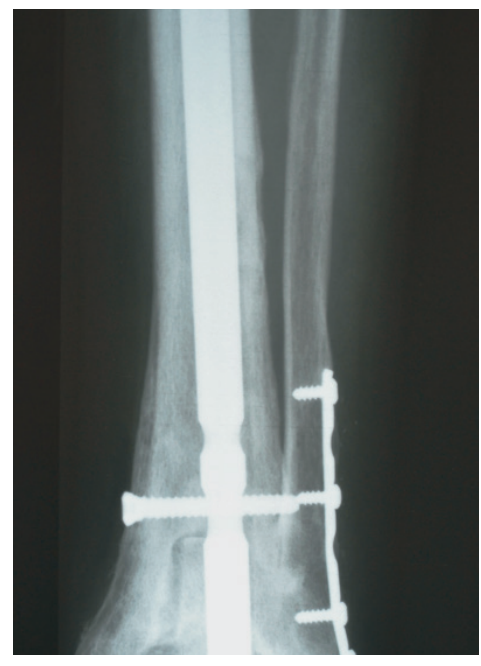
Figure 6E. Lateral view.