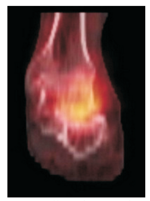
Figure 1. SPECT image demonstrating adjacent joint arthritis involving the subtalar joint after ankle arthrodesis.

The prevalence of ankle OA and its known effects on patient quality of life has given rise to the evolution of various total ankle implants that have continually evolved in the hopes of creating an implant that preserves motion,