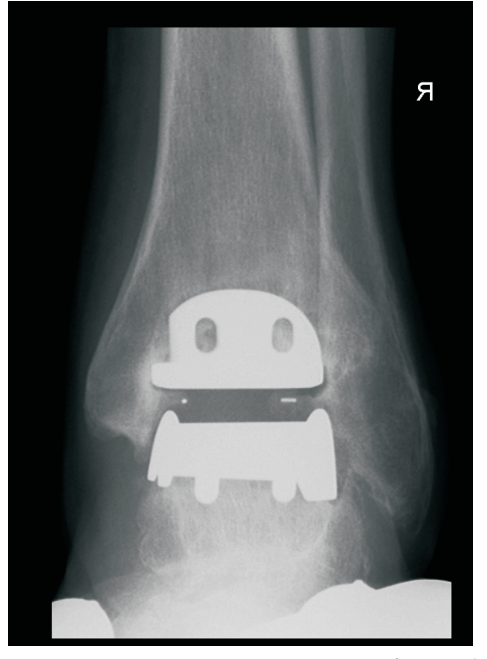
Figure 4B. Postoperative appearance after total ankle arthroplasty.