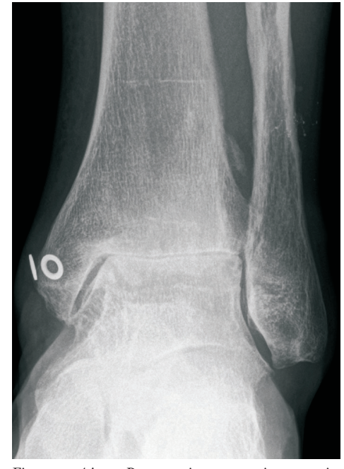
Figure 4A. Preoperative anterior-posterior radiograph demonstrating well-aligned ankle joint with post-traumatic arthritis in a 68-year-old female (note the retained hardware at the medial malleolus after prior open reduction internal fixation and subsequent hardware removal).

reported when looking at TAR in OA and RA (55). Pedersen et al compared 50 patients with RA to 50 patients with noninflammatory arthritis. These patients were matched with age within 10 years, prosthesis type, and follow-up time. All patients received a total ankle replacement, and revisions and major complications were recorded. The average follow-up was 63.8 months for the RA group and 65.6