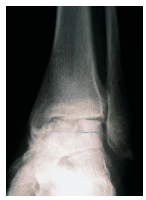
Figure 2. Anterior-posterior radiograph demonstrating avascular necrosis involving greater than 50% of the talar body.

General requirements and indications for TAR include primary osteoarthritis, secondary osteoarthritis and posttraumatic osteoarthrosis; adequate bone quality, ligamentous stability; proper vascular status and immunologic conditions; and well-aligned hindfoot with sufficient preoperative range of motion (38). Relative contraindications include status after major trauma (open ankle fractures, fracture-dislocations of the talus, segmental bony defects); eradicated infection; avascular necrosis of the talus (25-50% involvement); severe osteopenia or osteoporosis; longstanding steroid treatment (either systemic or local); diabetes mellitus (depending on control); and moderate physical demands. Absolute