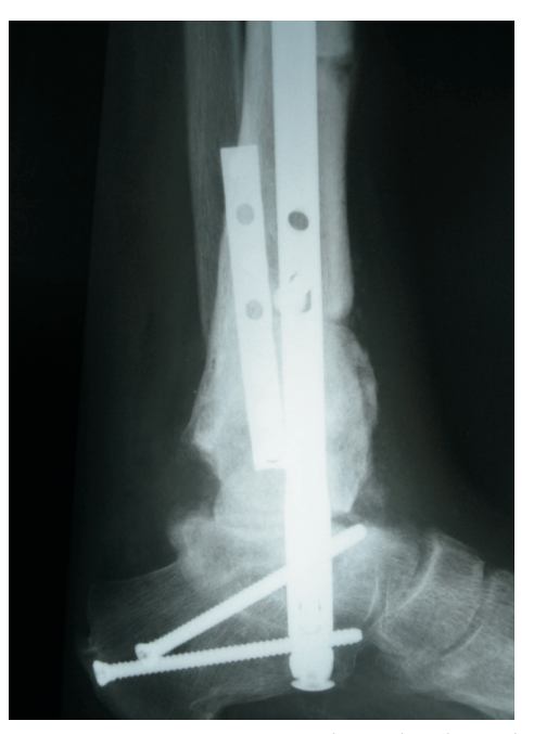
Figure 6D. Postoperative radiograph obtained 4 months after conversion to tibiotalocalcaneal arthrodesis demonstrating stable union without evidence of residual infection.