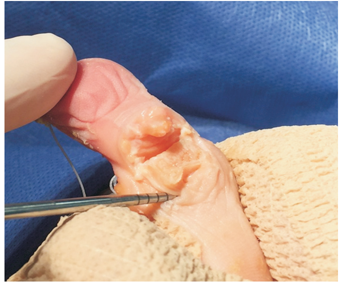
Figure 4. With the proximal phalanx exposed plantarly through the incision site the arthroplasty of the proximal phalanx head is performed.