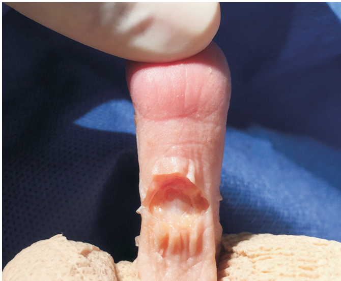
Figure 1. Transverse incision on the plantar aspect of the second proximal interphalangeal joint, followed by blunt dissection to the flexor tendon sheath.

The following is a detailed description of our proposed plantar incisional approach for PIPJ arthroplasty. The patient is prepped and the extremity draped in a sterile fashion. A typical V block of local anesthetic is administered with 3-5 ccs of 0.5% bupivacaine to the affected digit. A #15 blade is used to make a 1-cm transverse incision just proximal to the PIPJ using the proximal crease line as the parallel guide (Figure 1). Blunt dissection then follows to