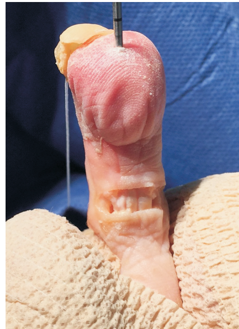
Figure 6. Once the phalanges are in an acceptable position, the flexor tendons are reapproximated with 4-0 Vicryl absorbable sutures.