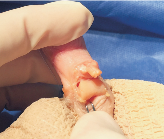
Figure 3. Transected flexor digitorum longus and flexor digitorum brevis tendons are visible. The joint capsule is entered with a transverse incision. The medial and lateral collateral ligaments are then cut, freeing the proximal phalanx and allowing it to be exposed plantarly through the incision site. At this point the EDL tendon is also visible dorsally and can be accessed if required.