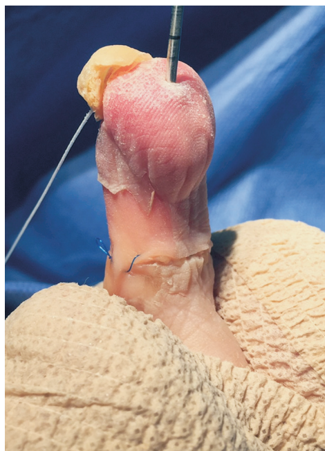
Figure 7. Running subcutaneous technique with 4-0 prolene is used to further minimize post operative scarring.