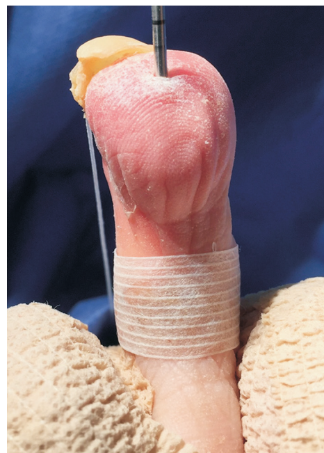
Figure 8. Incision site and suture is then covered with steri-strips for additional reinforcement and protection. Post-operative dressing and orders remain the same as traditional digit arthroplasty.

to its unique placement located in the nonweight-bearing portion of the PIPJ fold, as well as its orientation to the relaxed skin tension lines, the authors feel the risks are minimal. The transverse plantar approach also avoids the susceptible neurovascular bundles located on the lateral and medial aspects of the digit, therefore avoiding the complications of devascularization and necrosis.