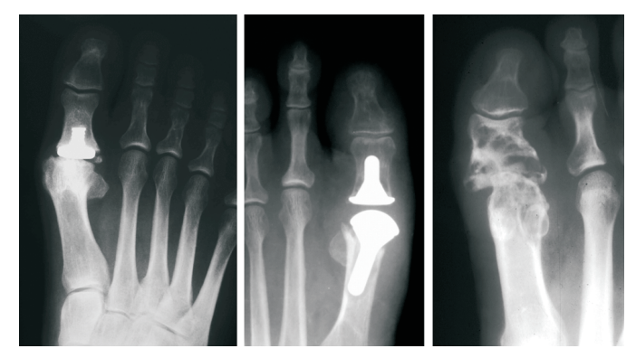
Figure 7. Radiographs illustrating a variety of osseous reaction: hypertrophic or ectopic bone (left), aseptic osteolysis (middle), and expansile tumor-like granulomatous reaction (right).

existing osteoporosis or inadequate implant fixation must be considered.