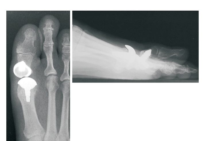
Figure 4. Radiographs illustrating alignment abnormality. There is rotation and displacement of the implant within bone as well as poor alignment of the articulation between the implant components with joint dislocation.

There are generally two permutations of alignment abnormalities, osseous deformity and joint malalignment