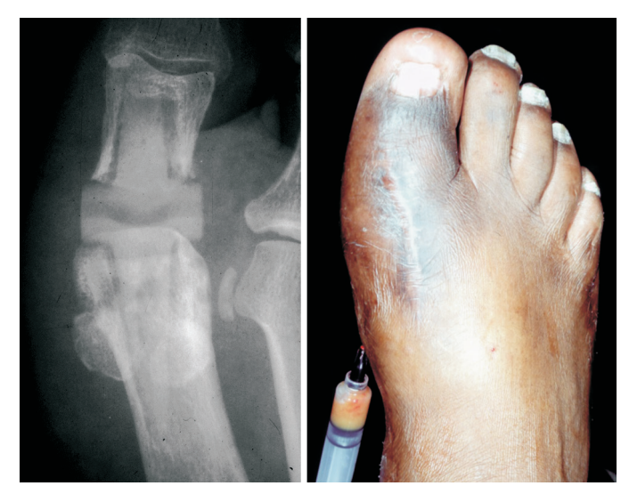
Figure 6. Infection. Radiograph showing radiolucency; osteolysis surrounding silicone implant associated with PPI. Pathologic fracture of medial distal first metatarsal is apparent (left). Aspirate from same patient (right).

Periprosthetic fracture is potentially a catastrophic event that may lead to gross instability of the joint or implant system. Implant arthroplasty alters the stress through the bone segments and may result in excessive loading or diminished stress though segments of bone. Generally, this is associated with inadequate osseous integration or inadequate reduction of deformity and high local stress. The material and geometry of the implant system should be designed in accordance with physiologic mechanical loads. Certainly, pathologic fracture associated with pre-