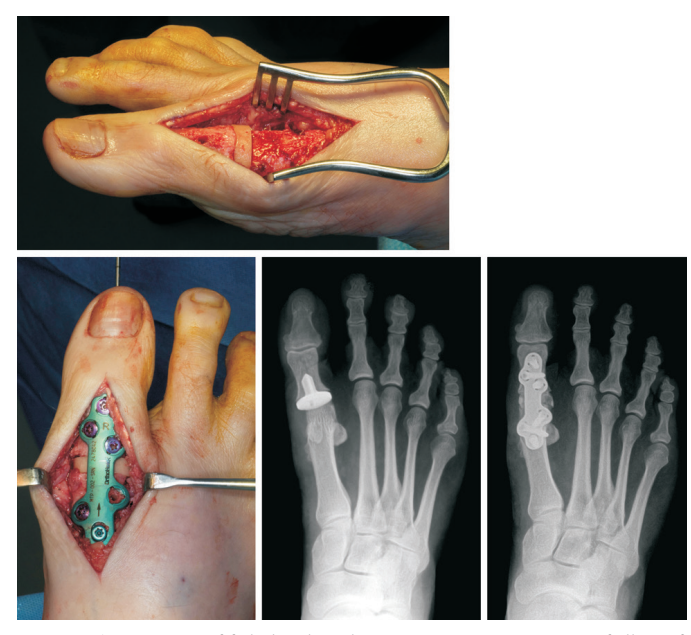
Figure 8A. Revision of failed arthroplasty. Intraoperative image of allograft prior to fixation ( top ), post-fixation with locking plate ( bottom left ), and preoperative radiograph ( middle ), and postoperative radiograph ( right ).

Was the initial surgical implantation successful with fixation or biointegration? Is there good alignment or has deformity or malalignment of the articulation become evident. Is metal allergy suspected? Do laboratory testing